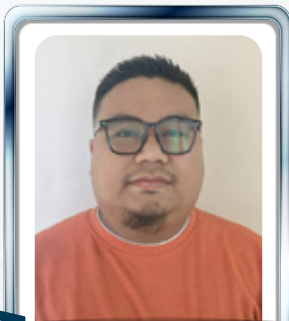
BURTEM Sü IMSONG